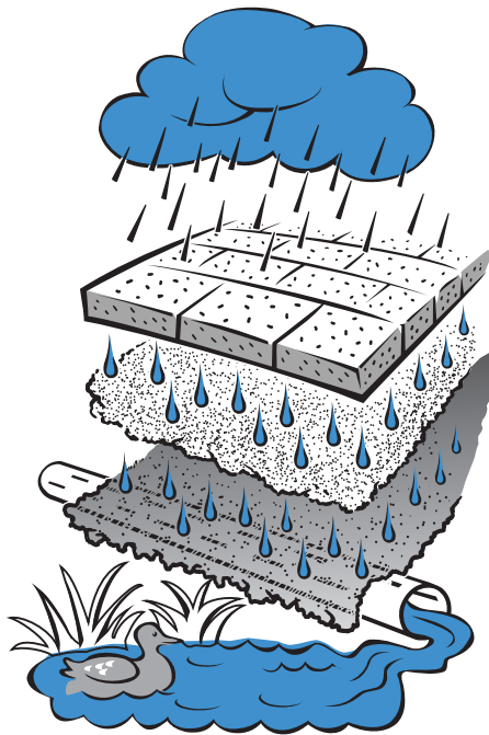
Porous paving will allow for drainage in urban areas.

Porous paving is installed in the same way as traditional paving and is available in many forms. They can be used to replace asphalt, concrete or other impervious pavers.